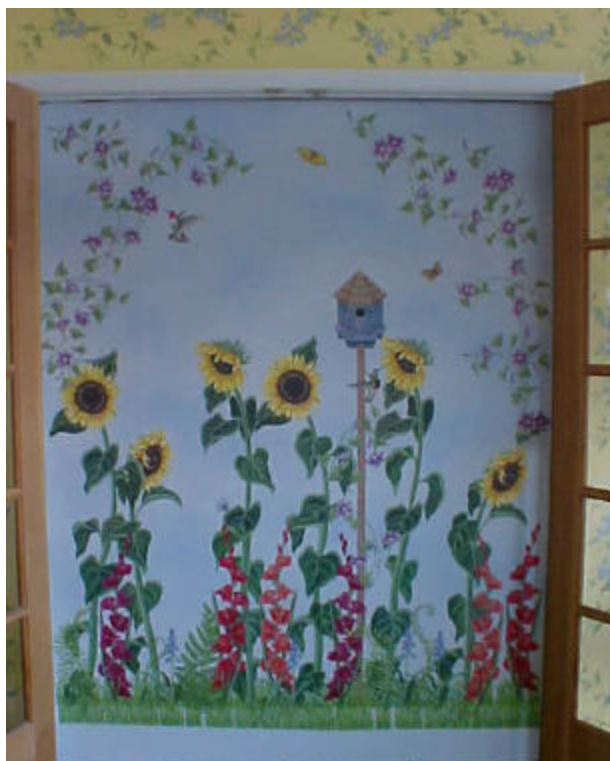
One Extra Sheet of Sunflowers and Grass Were Used on this Mural.

ALWAYS REMEMBER TO KEEP THE PROTECTIVE BACKING ON UNTIL YOU ARE READY TO RUB THE TRANSFERS ONTO THE WALL!